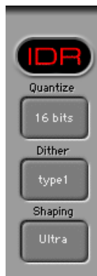
The IDR processor