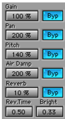
Master Reality control section