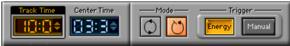
Track, Mode, & Trigger control section

In the middle of the Track is a draggable cursor (up/down only) which lets you curve the Track and adjust the path of the moving sound source.